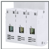
terminal capacity: max. 25 mm 2