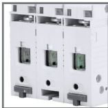
capability to connect using comb busbars