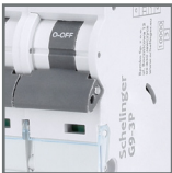
possibility of sealing